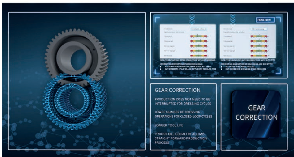
Fig. 4: Analysis and correction with Gear Corrector

The second class of GearEngine® data describes the production equipment. These are the tools, arbors and processing machines. The tools include cutter heads, grinding wheels, hobs and dressing rolls. Arbors are managed here with all of their individual components. A true digital twin of the processing machine (from which the static and dynamic behavior of this machine can be derived) is not possible today in practice or in theory. That is why the digital description of the machine is limited to the data of the dynamic fingerprints, ballbar results and similar machine-specific information.