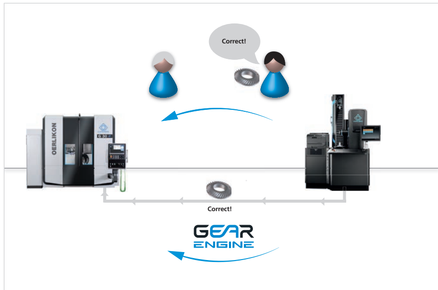
Fig. 2: Operator communication and integrated communication

This communication interface creates an essential basis for an automated workflow. In the near future, it will be possible to determine whether a correction should be used by means of algorithms with artificial intelligence (AI) – and then the correction can be automatically loaded on the relevant machining tool. GearEngine® already has the knowledge base required for AI.