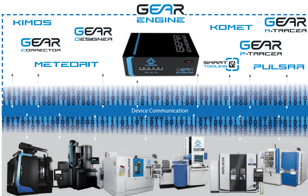
Fig. 1: The GearEngine® concept

Modern CNC machines collect a broad range of data. The challenge, however, lies in achieving a complete acquisition and interlinking all of this information. The objective here is to attain transparency and to optimize the entire process. GearEngine® from Klingelnberg takes on this task, creating an optimal foundation for Industry 4.0 processes.