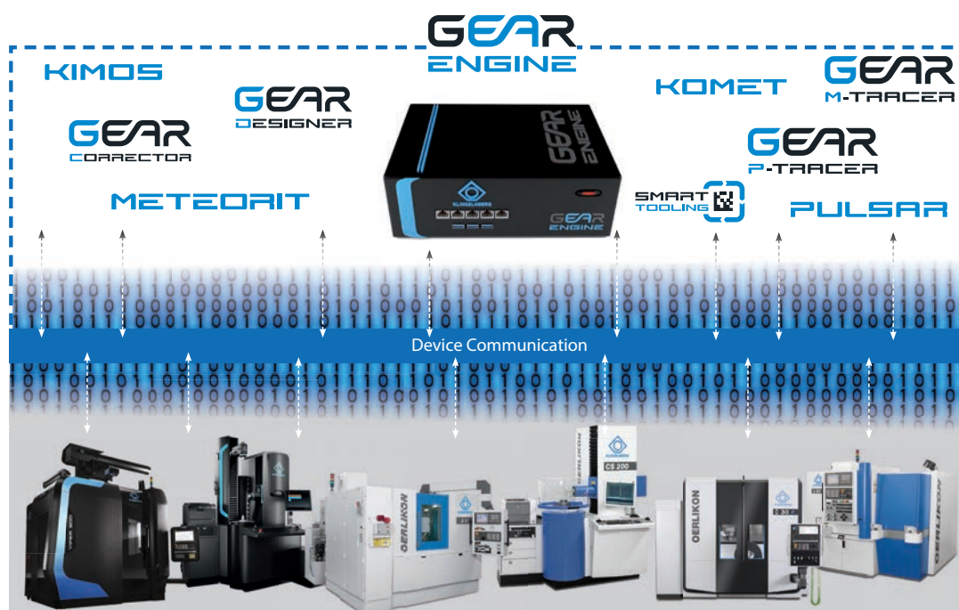
Fig. 1: The GearEngine® concept

Modern CNC machines collect a broad range of data. The challenge, however, lies in achieving a complete acquisition and interlinking all of this information. The objective here is to attain transparency and to optimize the entire process. GearEngine® from Klingelnberg takes on this task, creating an optimal foundation for Industry 4.0 processes.